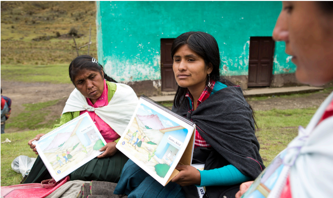
Community facilitator reinforcing flipchart use with CHWs in a Care Group in Peru.