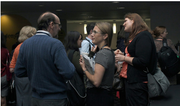
Fall 2015 Global Health Practitioner Conference.