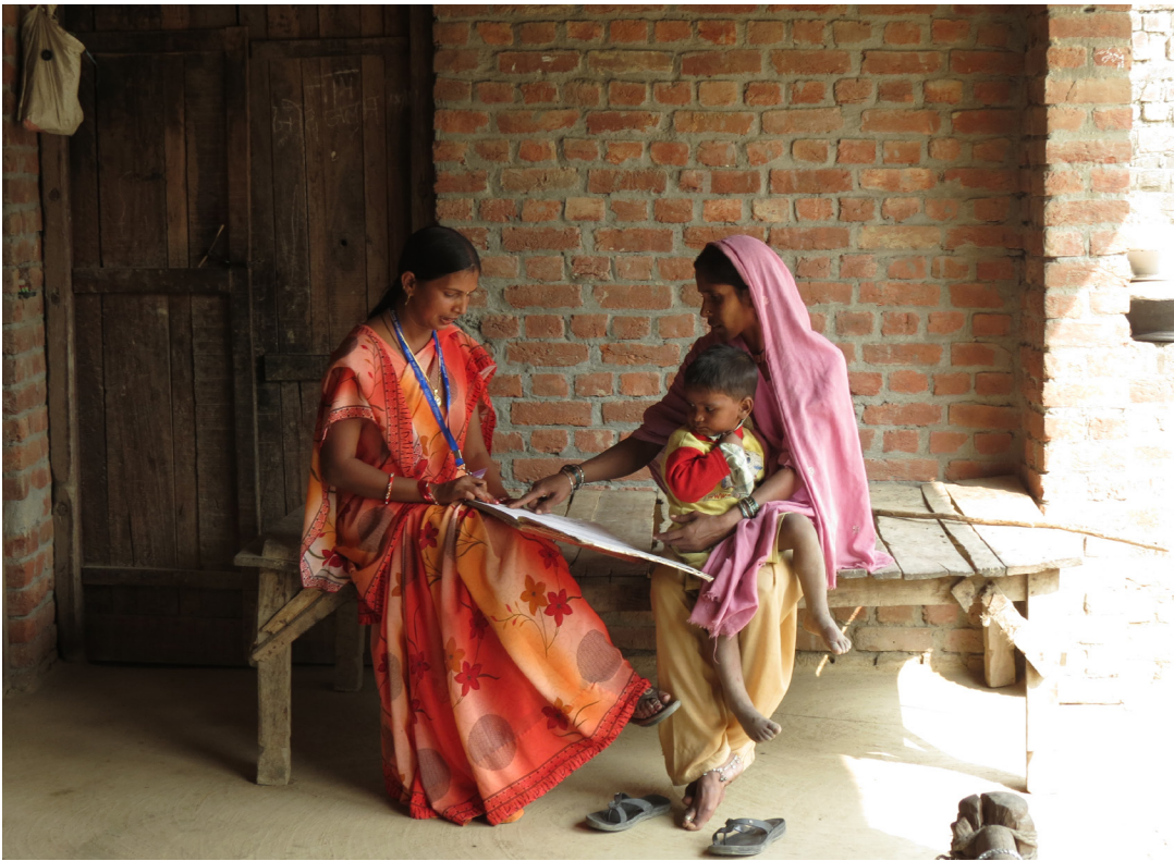
Interpersonal communication session during home visit by a mobilizer prior to polio campaign.

We represent 67 global nonprofit and non-governmental organizations (NGOs) working worldwide. We are public health professionals working together to develop innovative tools, resources, and programs to improve health outcomes. Our collaboration results in greater impact than organizations can accomplish individually.