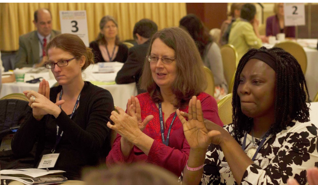
New Info Circuit at the Spring 2015 Global Health Practitioner Conference.

"It was such a wonderful conference (Spring 2015). I have so much to take back to all my country programmes!"