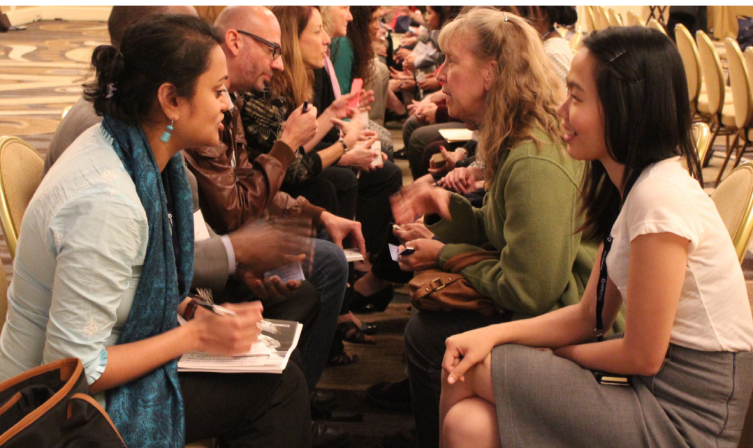
Cover image: