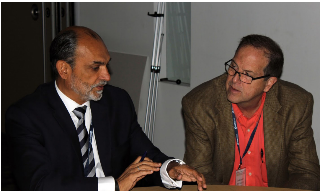
Participants chat at the Fall 2015 Global Health Practitioner Conference.

TOTAL UNIQUE REPRESENTATION: 586 PARTICIPANTS 149 ORGANIZATIONS 20 COUNTRIES