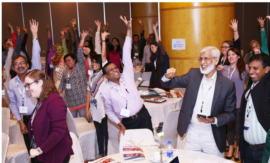
TOPS/FSN Network Knowledge Sharing Meeting in Dhaka, Bangladesh in March 2015.

CORE Group members contributed experiences and ideas for integrating nutrition into the integrated Community Case Management for Sick Children guidelines to provide front-line workers with tools for rehabilitating malnourished children.