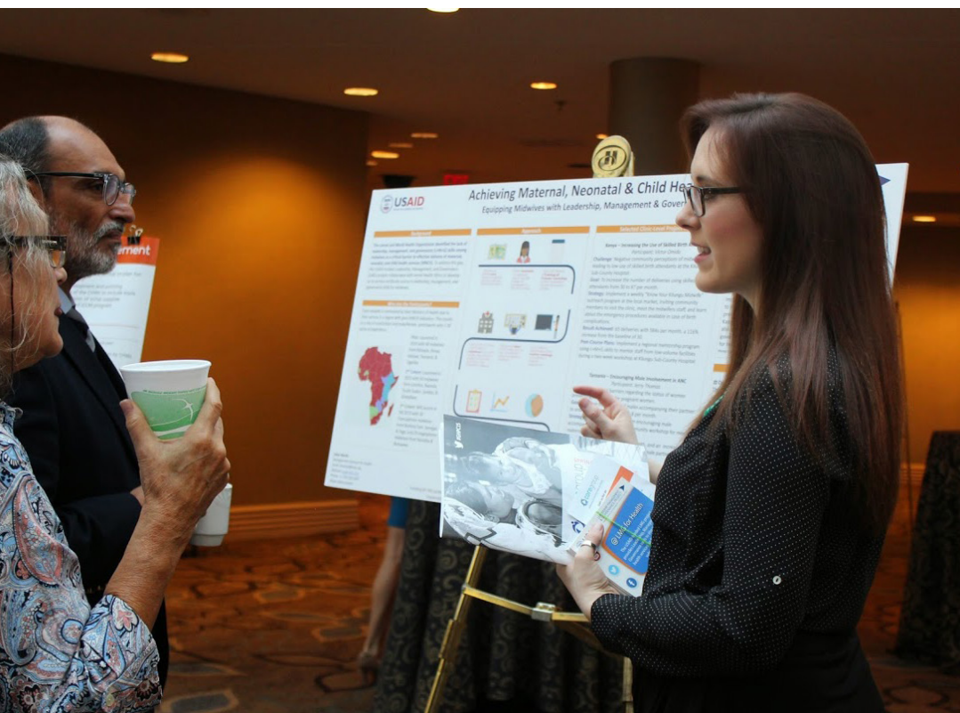
Participant presenting a poster at the Spring 2015 Global Health Practitioner Conference.