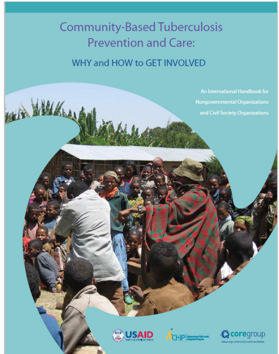
Above: CORE Group Resources.